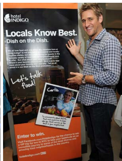
F&B | page 8