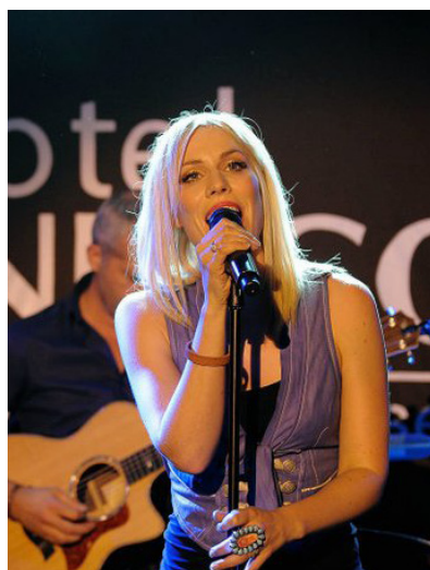
Music | page 6