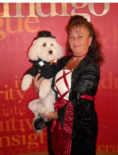
Pets | page 3