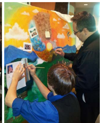
Art | page 11