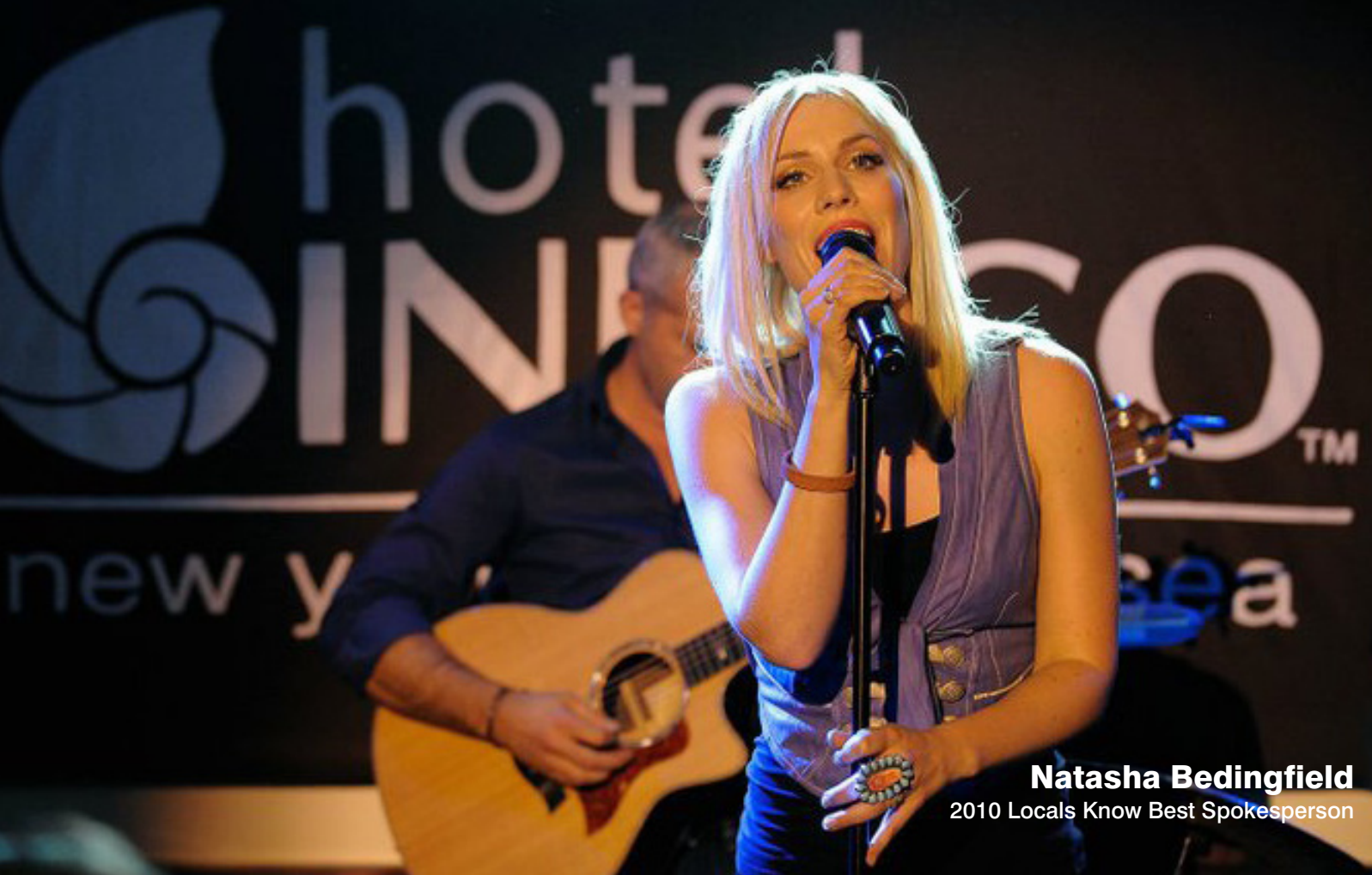
Natasha Bedingfield 2010 Locals Know Best Spokesperson

Live music is a natural gathering point in our neighborhoods and local musicians help to give our communities their unique personality and energy. Tap into your vibrant local music scene and create appealing events for up-and-coming music artists and their fans.